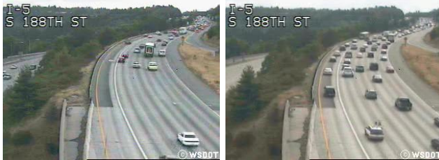
Fig. 1. Frames (Images) from the same Light traffic category of UCSD dataset [6] and associated prediction by a trained CNN model [7]

Recently there has been a huge increase in utilizing Convolutional Neural Networks (CNNs) [1], [2] to solve several real-life challenges such as traffic categorization [3], [4], weather forecasting [5], etc due to its high prediction accuracy/categorization in the aforementioned target applications. One particular case for harnessing the efficacy of visual CNN based prediction model is Intelligent Transportation Systems (ITS), which is becoming an important pillar in the modern “smart city” framework.