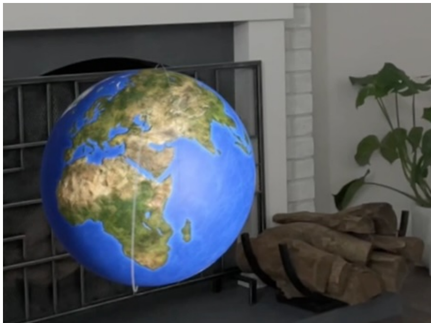
Figure 2: “Hello world” in visionOS and WebXR

Apple provides an example of “Hello world” in visionOS (Apple Inc., 2024), i.e. a spatial app that shows a floating globe (Fig. 2); this downloadable Xcode project contains 180 files, for a total of about 250 MB of source code.