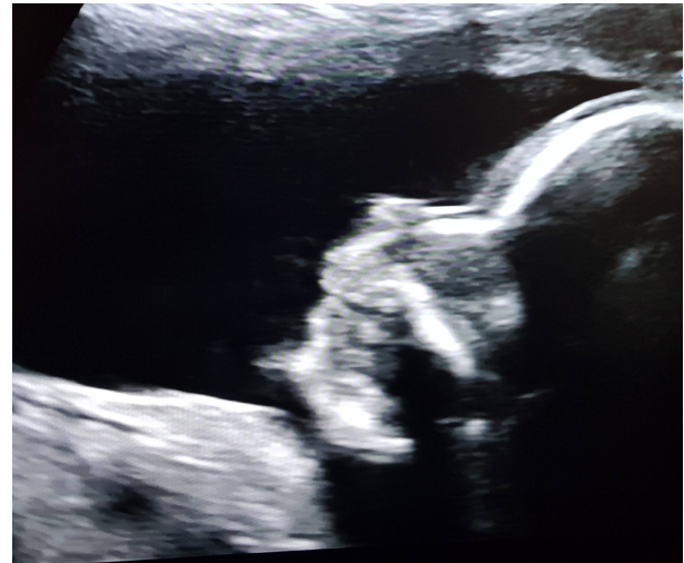
Fig. 2: Illustration of technology's three factors: human sight extension ( must ) via sound imaging ( medium ) and quadrature detection ( manner ). Profile ultrasound view of the author's daughter in November 1 st , 2017.

Given this threefold decomposition, it can be seen that technology's extensions may occur for more than one factor, non-exclusively. In the examples of fans, showers and houses, one could argue that they not only extend natural media (the wind, waterfalls and caves, respectively), but also human musts : coolness, cleanliness and protection. No understanding is lost, and a false dichotomy is avoided.