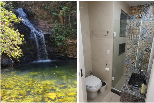
Fig. 1: Ancient and modern versions of a bathroom - nature extended .

The proposed definition of technology is a less anthropocentric extension of McLuhan's, helping to solve a few of its inconsistencies and complexities. For instance, it is common to illustrate McLuhan's idea with examples such as "wheels extending human motion" and "hammers extending fists", but several counterexamples show the complications of this theory, such as fans, showers and houses [9]. By defining technology as an extension of man and nature, the answer becomes much simpler: fans extend the wind, showers extend waterfalls and houses extend caves (Fig. 1).