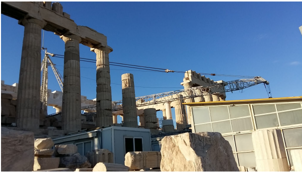
Fig. 4: Delicate meeting of engineering traditions: restoration of ancient Greek temple at the Athenian Acropolis in 2017. Modern techniques could rebuild the temple, but that would go against the place's must : preserving cultural heritage. Not maintaining the temple, on the hand, would also go against it.

From the previous points, it follows that an engineer's role is to offer the medium and the manner to the must . The term medium encompasses a very broad array of human and natural creations, from computers and rockets to languages and mathematical notation, so that engineering is best described by technology development under the scientific method and its main tools: mathematics and logic . Figure 4 illustrates this concept with the meeting of ancient and modern engineering traditions at the Athenian Acropolis in 2017.